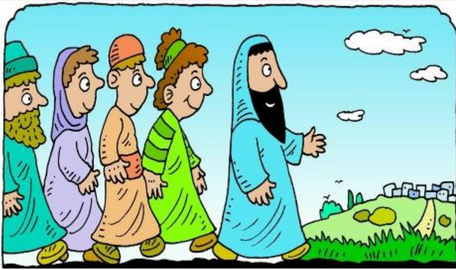
Jesus and his friends went to stay at Simon the Leper's house, in the town of Bethany.