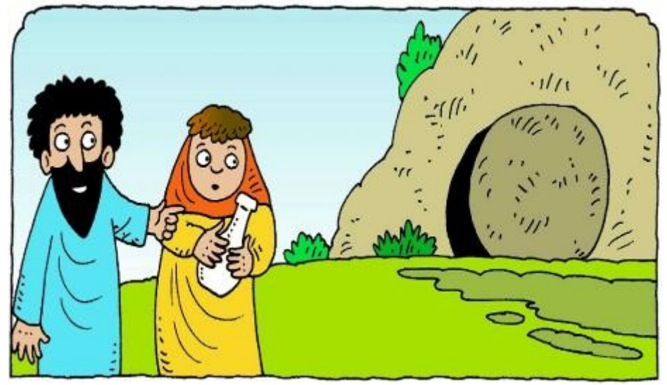
This woman knows that soon I will be dead and buried," said Jesus. "She gave it from a loving heart.