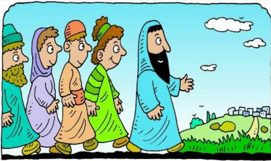
Jesus and his friends went to stay at Simon the Leper's house, in the town of Bethany.