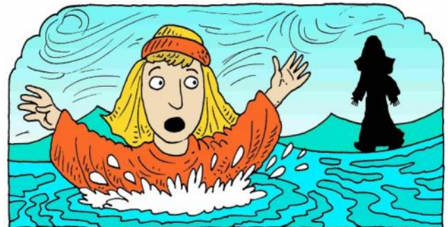
While he kept looking at Jesus he was safe. But when Peter looked at the stormy sea he was scared and began to sink down in the water. "Help me, Jesus," he cried!