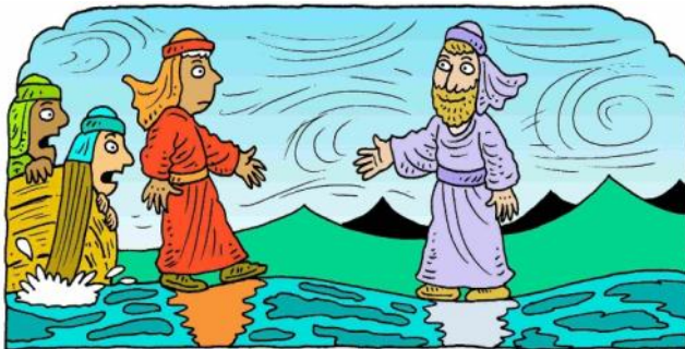
Jesus called out, "Don't be scared, it is only me." Peter couldn't believe his eyes and said, "If it really is you, Jesus, then tell me to come to you on the water." He got out and began to walk, on the water, to Jesus.