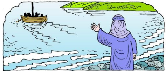
Jesus sent his helpers and Peter across to the other side of the lake, in a boat. He was tired. He wanted to be by himself to rest and pray. He had been talking to lots of people, all day.