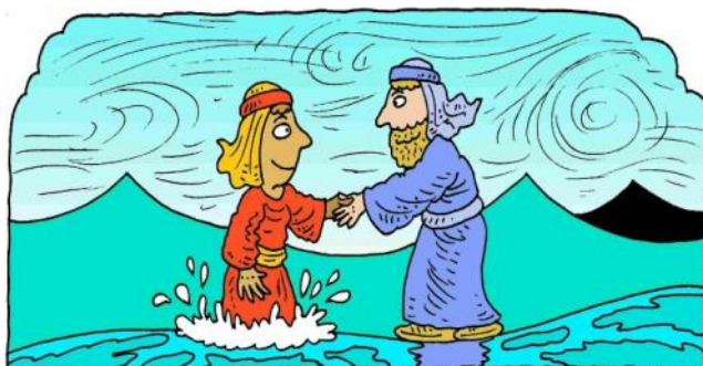
Jesus reached out his hand and caught Peter. Even though the wind blew and the waves crashed around him, while he kept looking at Jesus, Peter was safe.