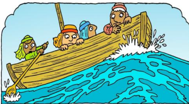
Soon, the wind began to blow and the waves got bigger and bigger! Peter and his friends were getting scared. "If only Jesus was here," they said.