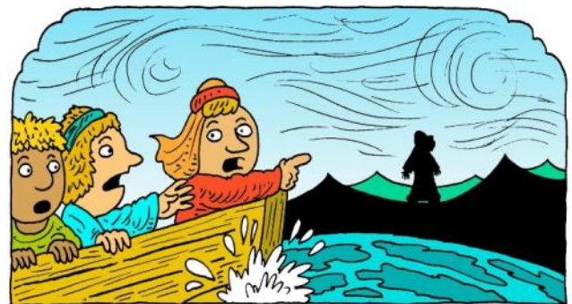
Then they saw someone coming towards them, walking on top of the water! No one could walk on water like that! They were scared.