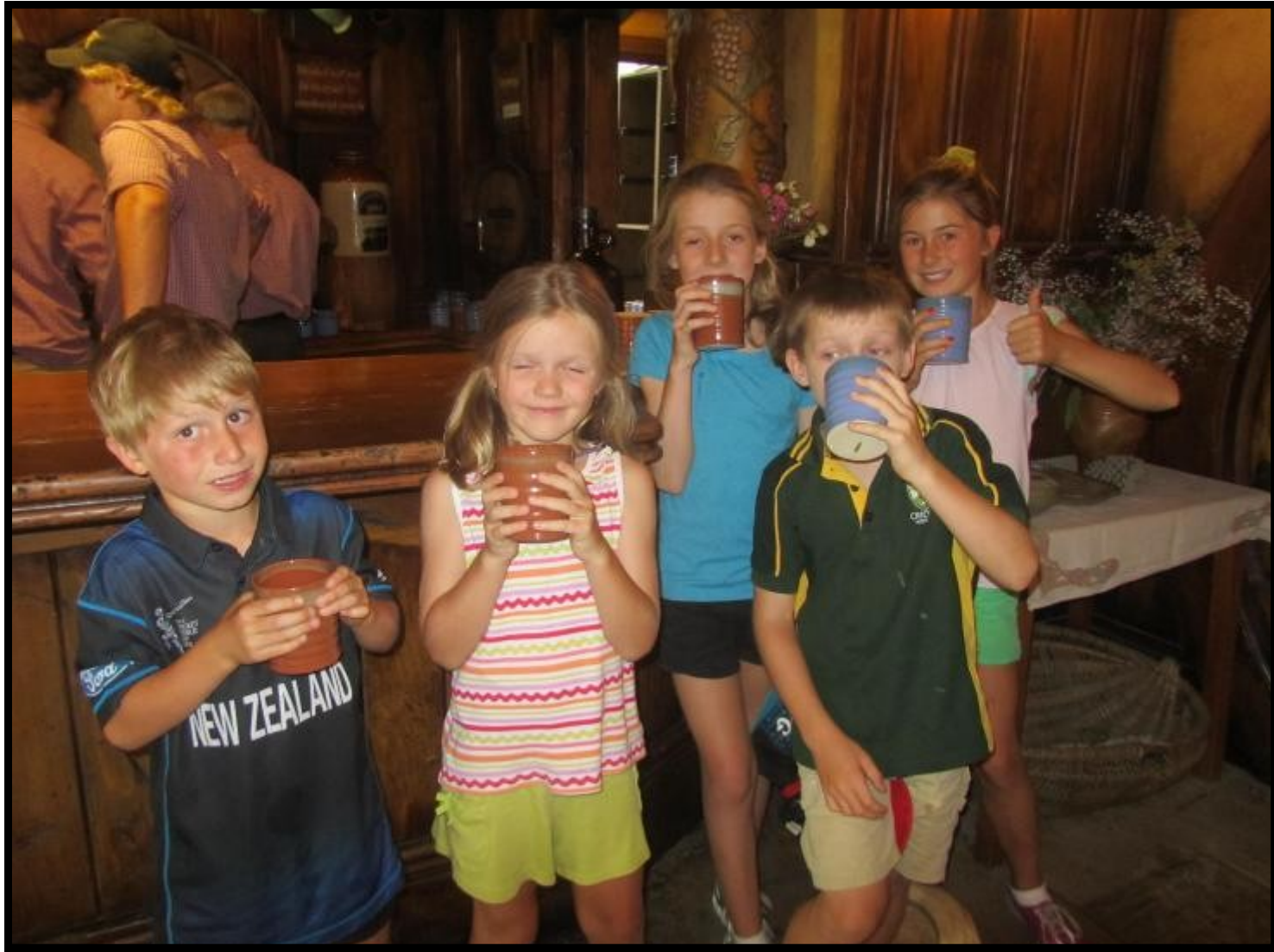
The children enjoyed a free mug of Ginger beer brewed especially for the Dragon's Rest Inn. One end of the Inn is Hobbit sized.